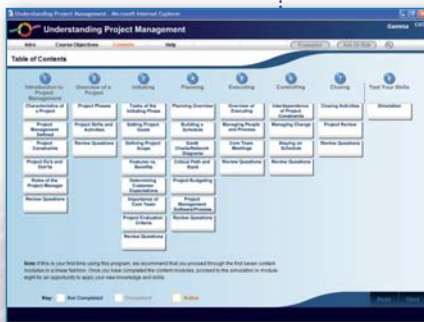
The user-friendly graphical interfaces allow for easy navigation and learning.

Understanding Project Management™ is an integrated learning tool that helps individuals understand and apply the Project Management process.