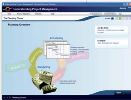
Thoroughly explore the Process Groups of Project Management: Initiating, Planning, Executing, Controlling, and Closing.

Understanding Project Management™ is a self-paced on-line or cdrom learning experience designed to help learners develop and apply project management skills and practices. With hands-on tools such as Work Breakdown Structures, Gantt Charts and Roles and Responsibilities Charts, Understanding Project Management™ gives learners the edge they need to manage projects for success.